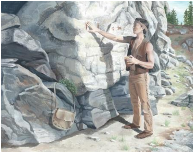
Syilx Man on a Quest

Okanagan History Like You've Never Seen it Before