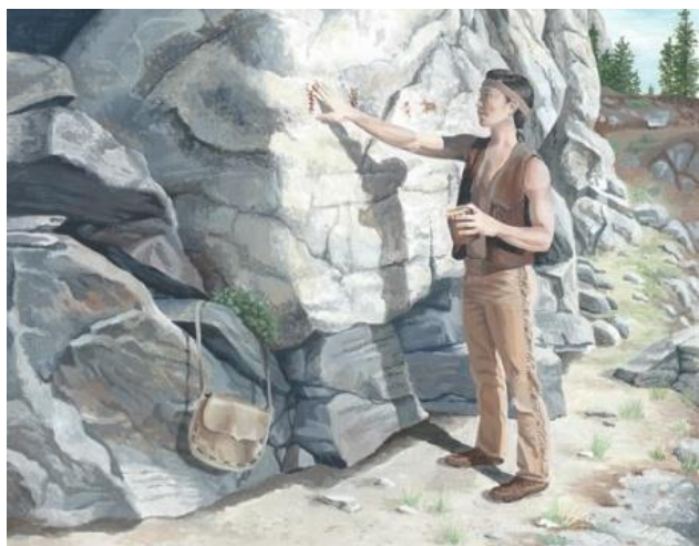
Okanagan Man on a Quest

Okanagan History Like You've Never Seen it Before